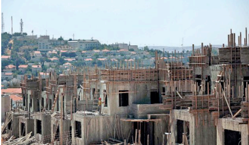
Construction work in Elazar, a settlement in the Gush Etzion bloc, in July 2010.